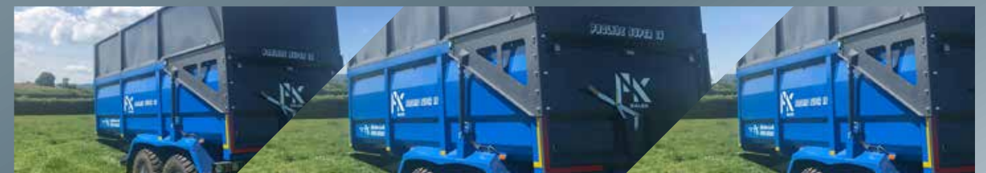
BALE - PAGE 7