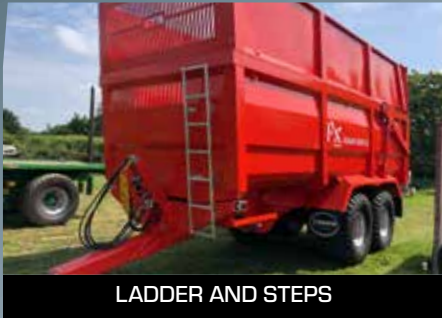
LADDER AND STEPS