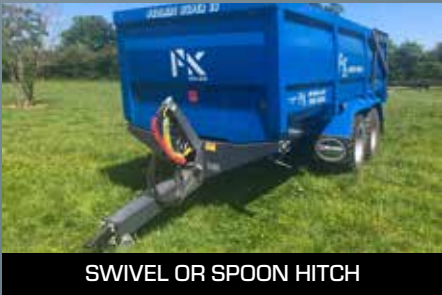
SWIVEL OR SPOON HITCH