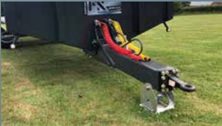
SWIVEL OR SPOON HITCH