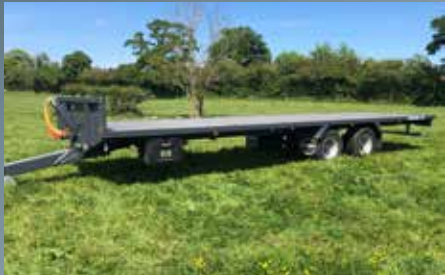
LADDER AND STEPS