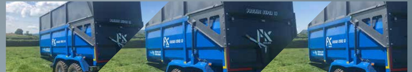
GRAIN - PAGE 5