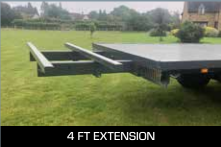
4 FT EXTENSION