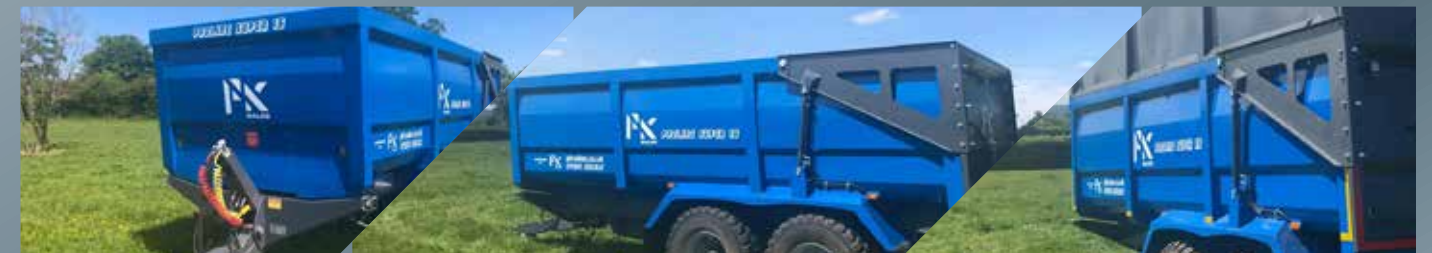
SILAGE - PAGE 5