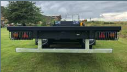
REAR FLASHING LED BEACON