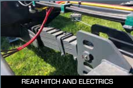
REAR HITCH AND ELECTRICS